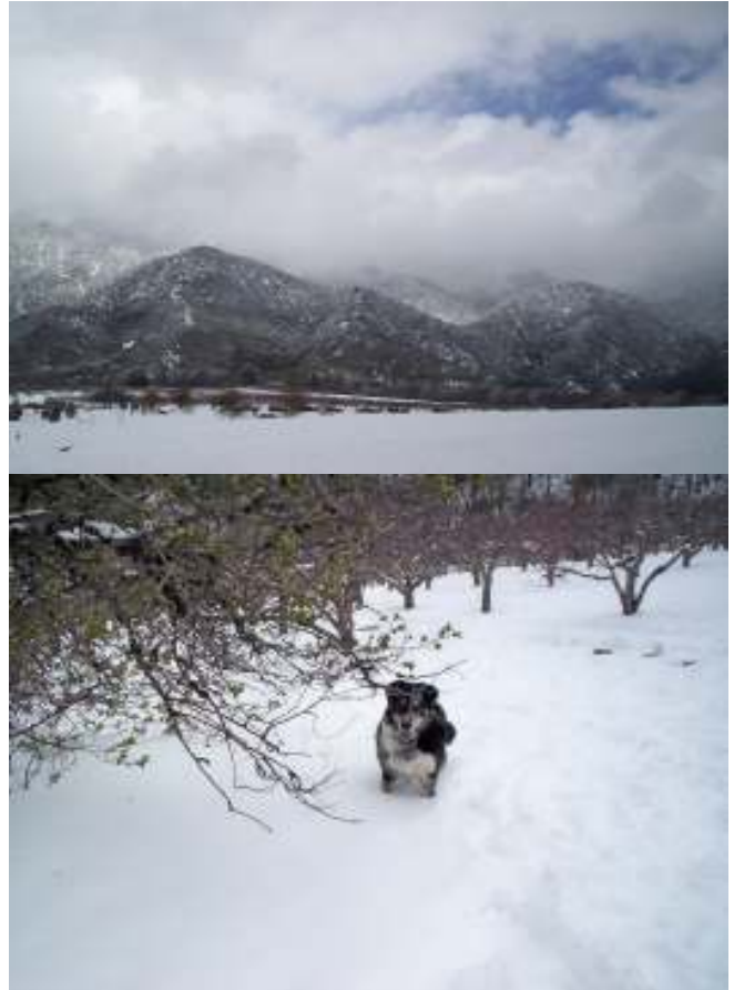
Pepper at Oak Glen, March 2006